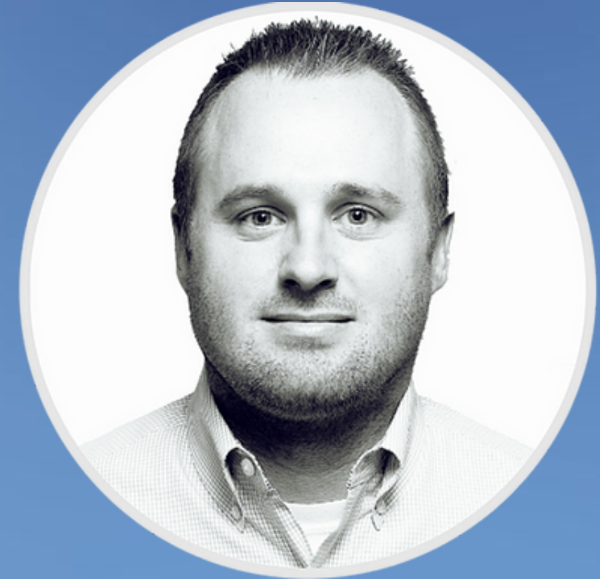
Alex Training and Course Support