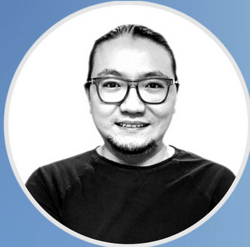
Otto Graphic Design & Branding