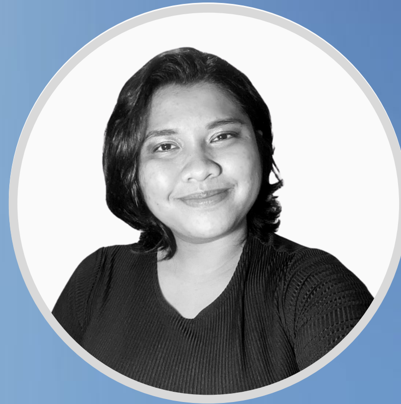
Marianne Broker Support & Onboarding