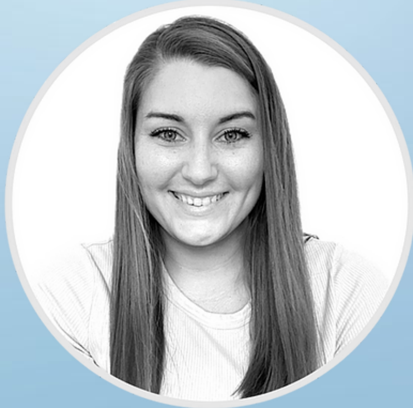
Kassey Broker Support & Onboarding